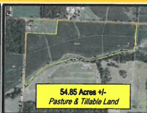
54.85 Acres +/- Pasture & Tillable Land