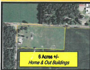
6 Acres +/- Home & Out Buildings

For more photos of this beautiful property please visit: www.powersauction.com or www.jimsullivan-realty.com